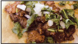
Carne asada taco

Restaurant and DeNada Art Gallery are open: 8am-9pm Monday to Saturday, 9am-6pm Sunday 1212 SE Division • For to-go orders: 503-445-6289