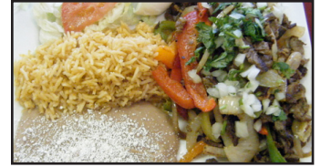
Carne asada fajitas plate